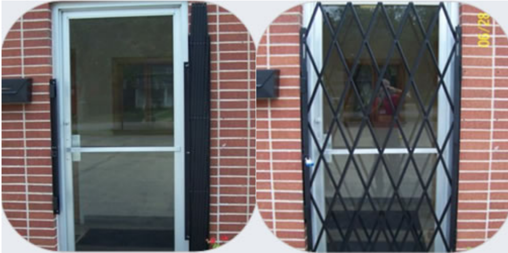
Not in Use